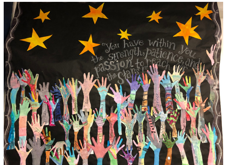
Student work in the great room.